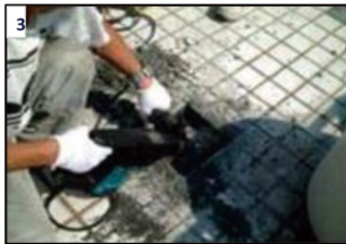
3) Cut ground larger and deeper than 1cm solar tile.