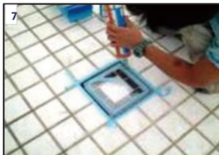
7) Fix solar tile by silicone or urethan ( no acid ingredient)