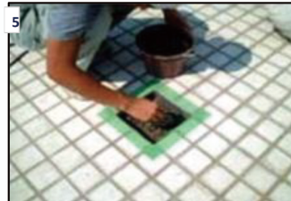
5) Spread silicone or urethan in bottom side