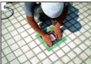
6) After put solar tiles in ground, press solar tile