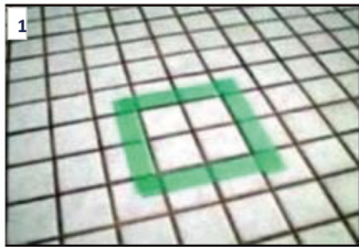
1) Mark the place of installation